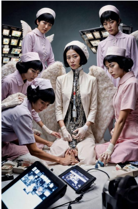
Ornament Survival - Nursing the Machine (2026)

HONG KONG — At Art Basel Hong Kong 2026 Zero10, Tokyo-based gallery √K Contemporary is proud to present Ornament Survival , a new installation by multidisciplinary artist Emi Kusano.