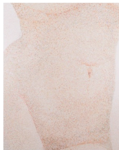
A Whole Painting Filled with Holes (2023) Oil on cotton, 162 x 130 cm

Although the boundary between self and other appears evident, there is no particular form that physically defines this difference. Nevertheless, the “body” is commonly perceived as its own, “individual” form. If there is no true boundary