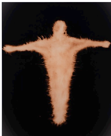
Bleaching #3 , (2023) Bleach, black cloth, 221x182 cm