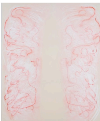
Why do I have two hands, eyes, and nipples on my both sides? (2023) Pastel on cotton, 194x162 cm

that defines this perceived difference, then what is the 'body' in which the 'self' exists?