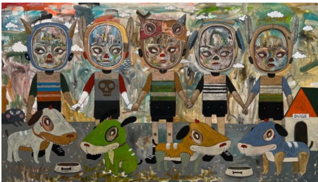
Hold My Hand , 2023 Acrylic on canvas 152.4 × 240 cm

√K Contemporary (Root K Contemporary) is proud to host Yes, Can Do! , Reen Barrera's inaugural solo exhibition in Japan. On view from August 5 (Sat) to 26 (Sat), the exhibition will showcase a comprehensive range of Barrera's works; from the artist's universally beloved Ohlala and Duge works to his kinetic automata wooden sculptures and experimental abstract paintings. Further highlights include an artist-led gallery tour, which will be held on the first day of the exhibition.