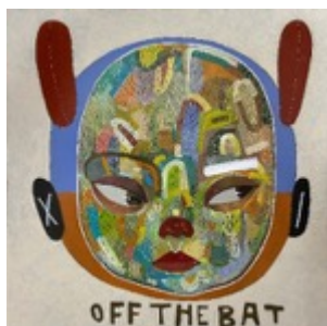
Off The Bat, 2023 Acrylic on canvas 121.9 x 121.9 cm

The "Yes, Can Do!" mindset refers to a positive and proactive attitude where individuals believe in their abilities to overcome challenges and achieve their goals. It's about being confident, resourceful, and willing to take on tasks or responsibilities without being deterred by obstacles or difficulties. This mindset is particularly relevant when discussing the socio-economic status of children.