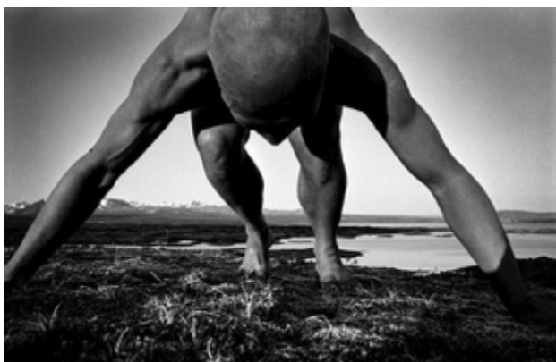
Island-22 (Photographed in 1980) Archival pigment print, 150 × 225 cm