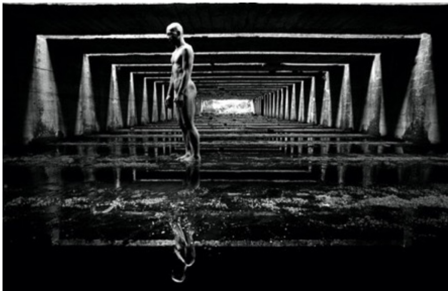
Bordeaux-11 (photographed in 1980), gelatin silver print, 122x177cm

√K Contemporary is proud to host Existence , a solo exhibition of the acclaimed Japanese photographer, Keiichi Tahara's works. On view from June 17 (Saturday) on through July 15 (Saturday), 2023, the exhibition will present a comprehensive display of the artist's complex oeuvre over the years.