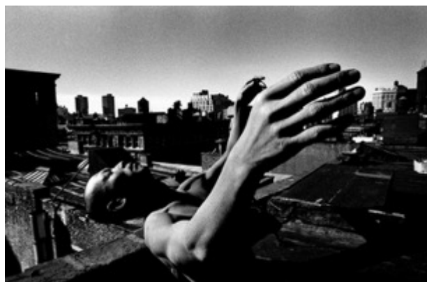
New York-1 (Photographed in 1978) Gelatin silver print, 40 × 50 cm