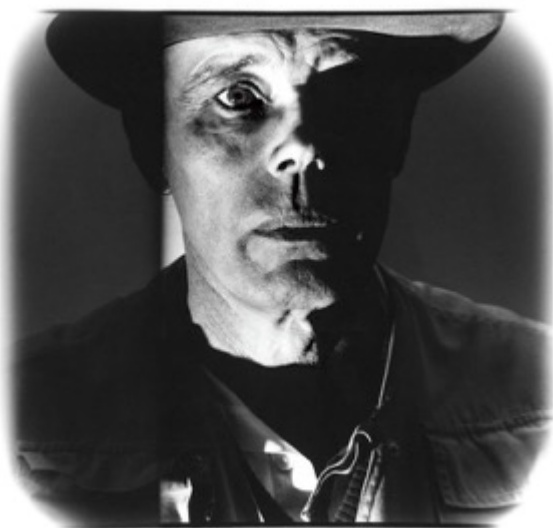
Joseph BEUYS (Photographed in 1981, Paris) Gelatin silver print, 100 × 100 cm