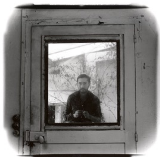
Christian BOLTANSKI (Photographed in 1979, Paris) gelatin silver print, 100 × 100 cm