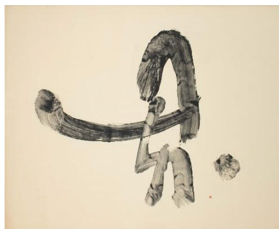
Work 70-A , 1970

Due to popular demand, the exhibition held in commemoration the 110 th year since the artist's birth in 2022, HIDAI NANKOKU has undergone a partial exhibition changeover and has been extended until February 4 (Sat). Featuring previously unexhibited works, the renewed 2023 display offers a rare and comprehensive presentation of the artist's diverse oeuvre.