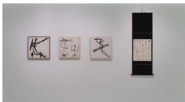
From the left Shinsen No.5 , 1947 Work No. 6 Kanae and Funeral , 1947 Work No. 7 "Bird and Bow" , 1949 The Analects , 1953

For details on the exhibition, visit: https://root-k.jp/exhibitions_en/hidai-nankoku_2022/