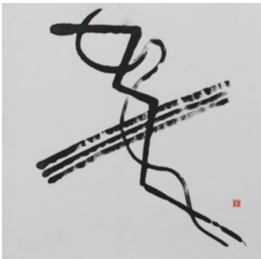
No. 7 "Bird and Bow", 1949 Ink on paper