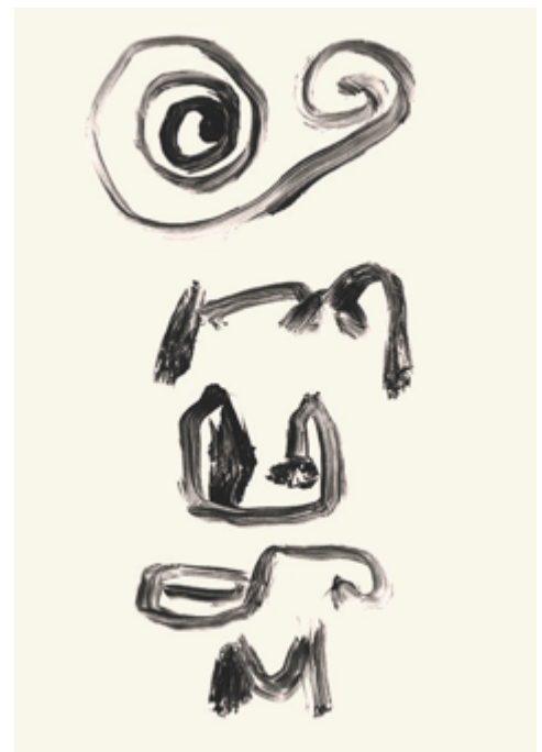
67-3, 1967 Ink on torinoko paper Private collection

Although this year marks the 110th year anniversary of the artist's birth, his name is rarely mentioned in 20 th -century art history, and, knowing how many have reacted to his work, I can't help but feel a sense of incongruity.