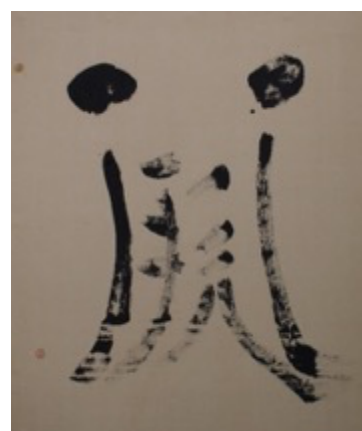
64-10, 1964 Ink on paper