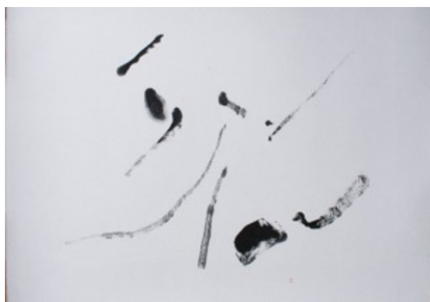
61-3, 1961 Ink on paper