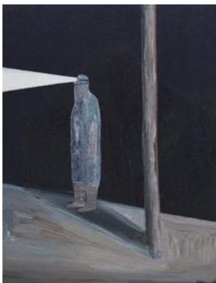
Lyndon Maglalang Untitled , 2022 81 x 61cm Acrylic and dry paint on canvas