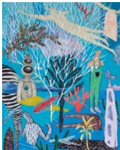
Imam Santoso The Dead Tree Shadow , 2021 100 x 80 cm Acrylic on canvas