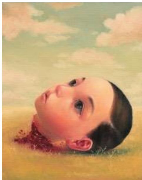
Roby Dwi Antono Dara Dan Tanah , 2015 Oil on canvas 35.5 x 25.5 cm

√K Contemporary (Root K Contemporary) is proud to host Neo-Animism: 11 Artists of Southeast Asia . On view from October 8 to 29, the group show will present a variety of paintings and sculptural works by a selection of coveted Southeast Asian artists, many of which will be exhibiting for the first time in Japan.