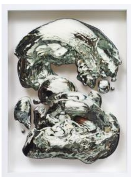
Sid Natividad After The Storm , 2022 61 x 45.7 cm Oil and resin on wood