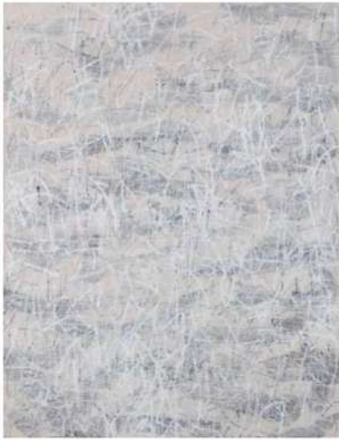
The Garden of the Fall and Rebirth-32 , 2017