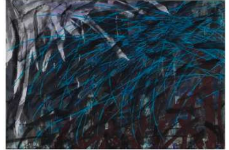
Voice of Wind-50 1990