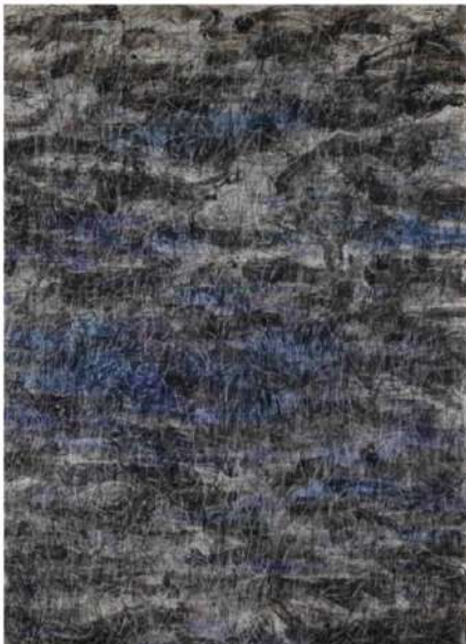
The Garden of the Fall and Rebirth-13 , 2015

"It was a mysterious garden. I planted various seeds and plants from all over the world. Most of them failed to grow and quickly perished. However, some could adapt to their environment and survived by hybridization, through mating with other plants. While these plants were compelled to crossbreed to survive, the garden was undeniably sensual... My wife said to J, "This is the garden of fall and rebirth". For a moment, J was confused, but nodded and said: "that's a good phrase" and continued, stating "Kosai's endless drawing, that too is an undeniable act of fall and rebirth."