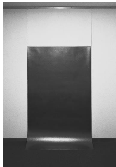
Drawing 84 , 1984, Pencil on paper, 245 ×112cm