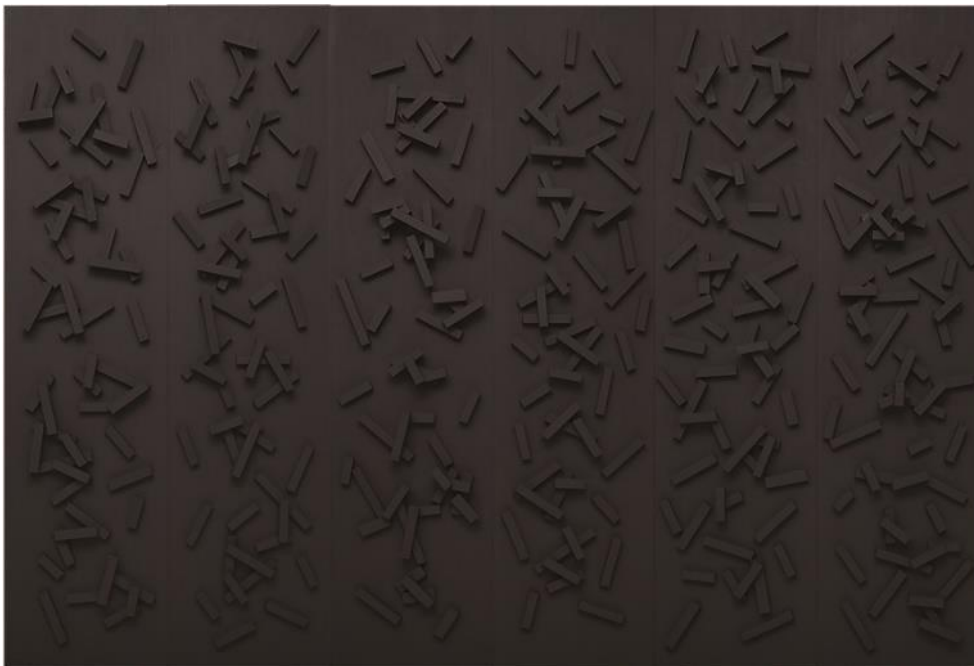
2-2-17, 2020, Paint and woodblocks on plywood, 180 ×273cm

A new series of semi-sculptural works will be unveiled at this exhibition. Stepping away from two-dimensional modes of production, these works reflect the artist's continuous endeavor to address and express where he is "now". A work of light and shadow, these works reflect visceral, primordial notions of the self. One of the key works from the exhibition, "2-2-17" (2020), consists of 6 panels that amounts to 3m in width. An entirely black surface of overlapping woodblocks, the formal texture of the work changes the experience of the work completely from the angle of sight. These pure expressions of light and shadow reflect the sensitivity Hamada developed over 80 years of age.