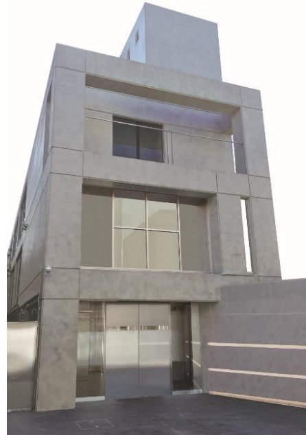
√K Contemporary exterior

For the past decade, the advancement of the Japanese art market has been the core ambition of √K Contemporary founders. As respected Japanese calligraphy and antique painting specialists, they have contributed to various projects and exhibitions and continue to actively address the various gaps in the Japanese art market.